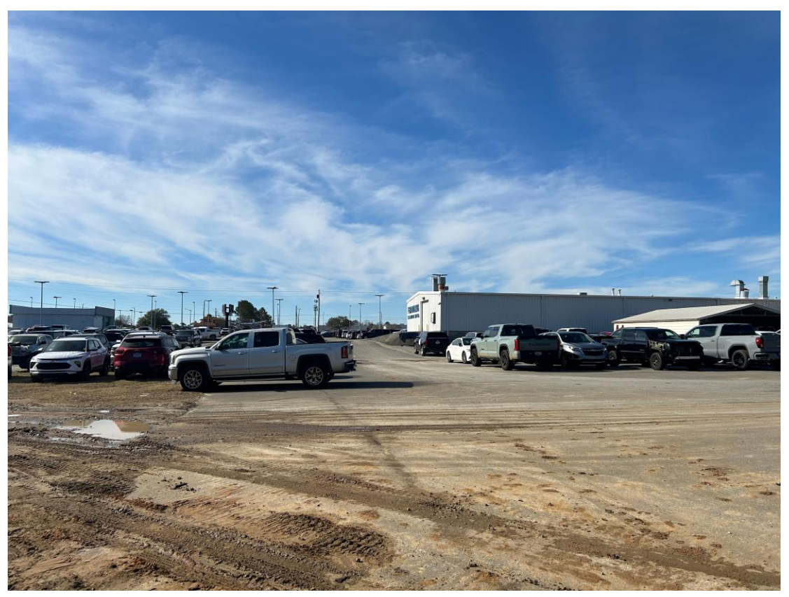
Page 9 of 11 Development Services Report Case V 25-01-03