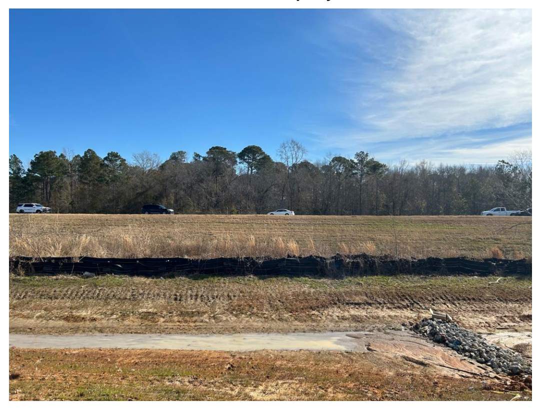
Page 8 of 11 Development Services Report Case V 25-01-03