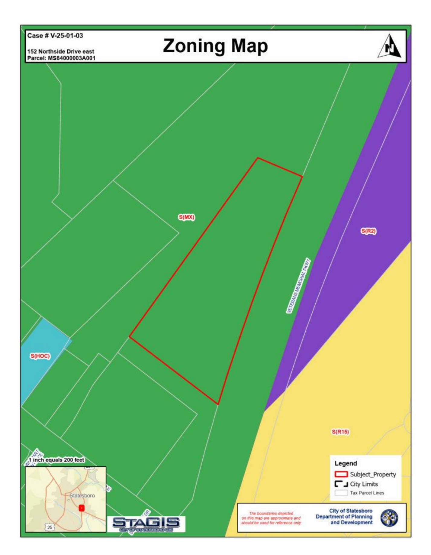
Page 3 of 11 Development Services Report Case V 25-01-03