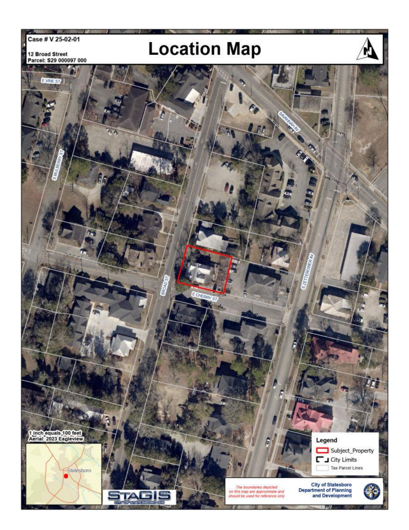
Page 2 of 10 Development Services Report Case V 25-02-01