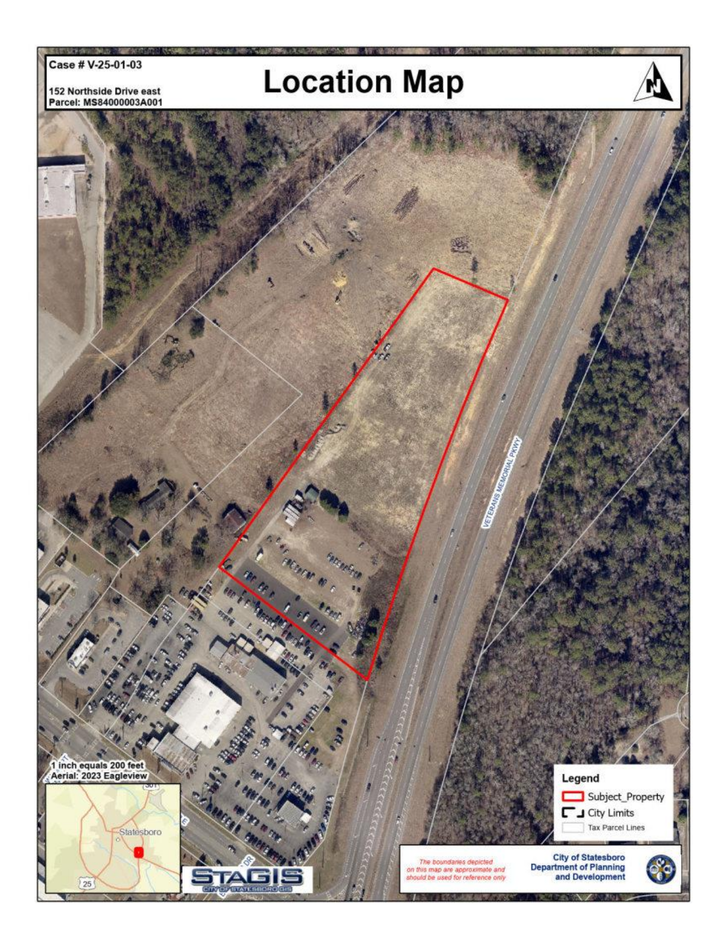
Page 2 of 11 Development Services Report Case V 25-01-03