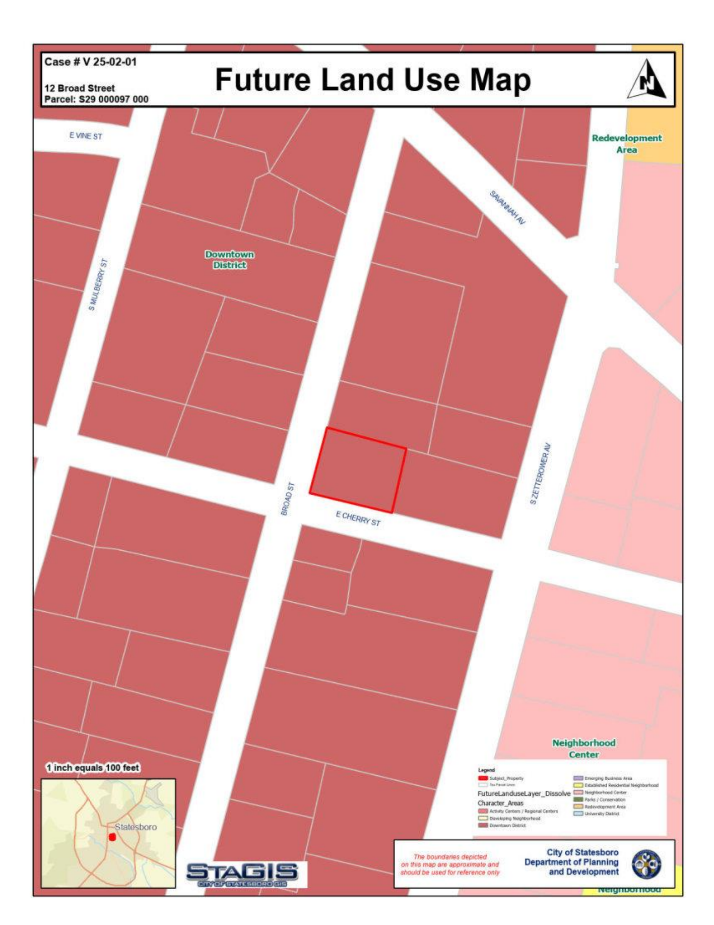
Page 4 of 10 Development Services Report Case V 25-02-01