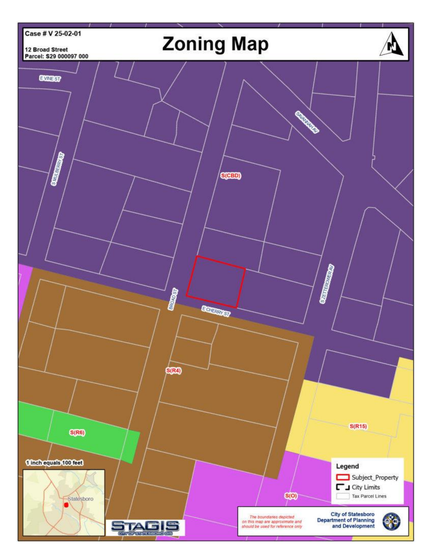
Page 3 of 10 Development Services Report Case V 25-02-01