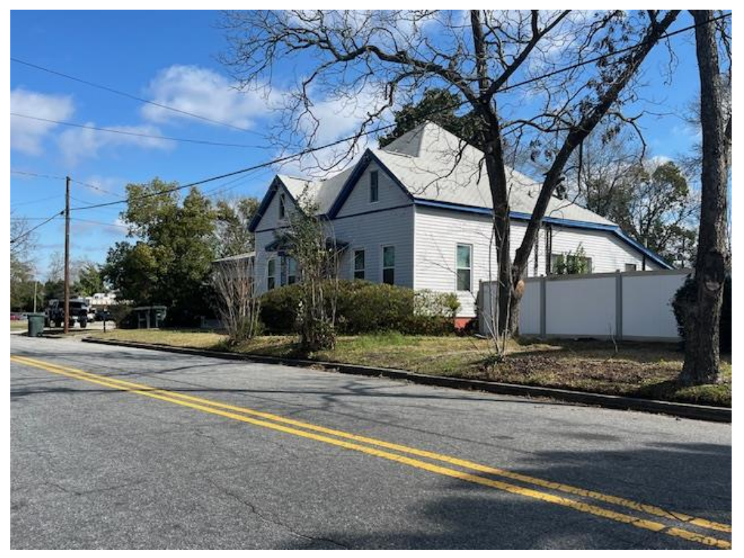
Page 8 of 10 Development Services Report Case V 25-02-01