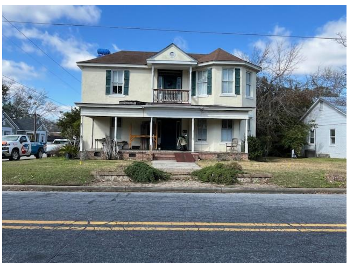
Page 9 of 10 Development Services Report Case V 25-02-01