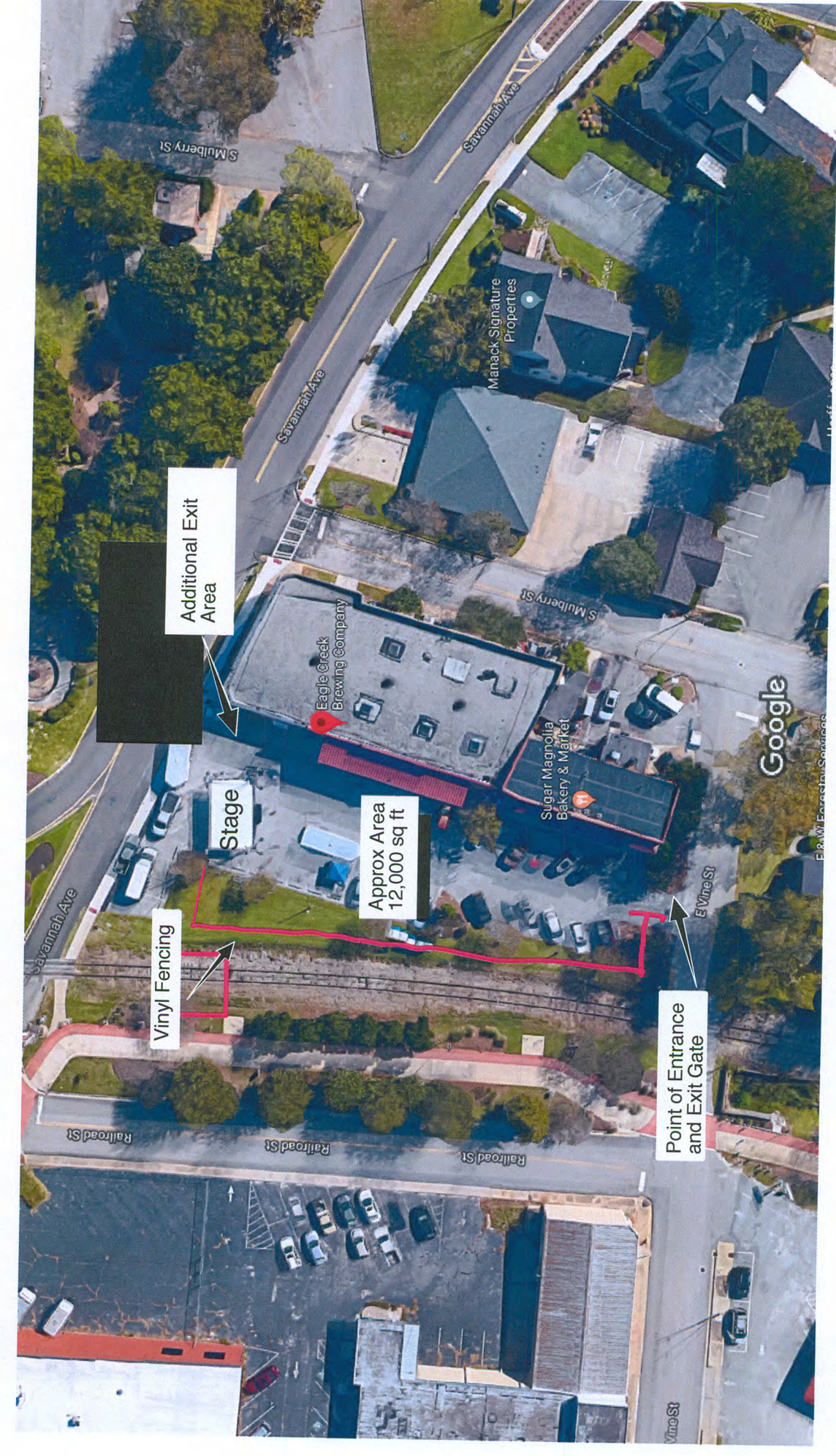
100 ft